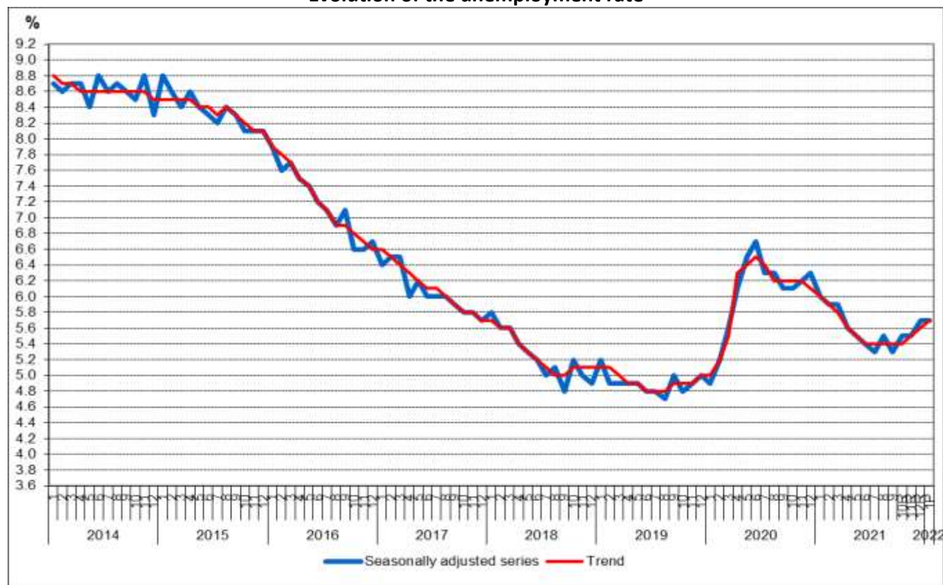
Evolution of the unemployment rate

R Revised data, P Provisional data - according to data revising policy (see point 6 in Methodological explanations ).