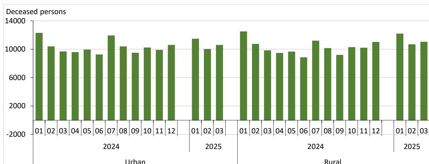
Fig. 3 Evolution of the number of deceased persons by area of residence from January 2024 to March 2025