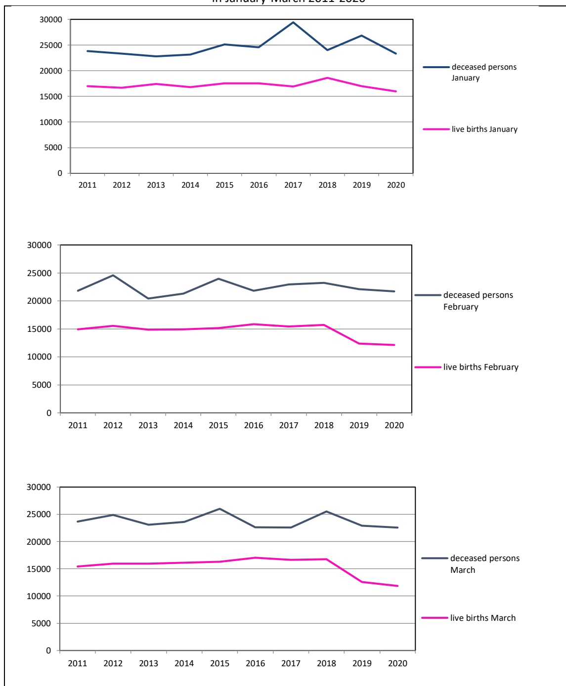
Evolution of the number of live births and deceased persons in January-March 2011-2020